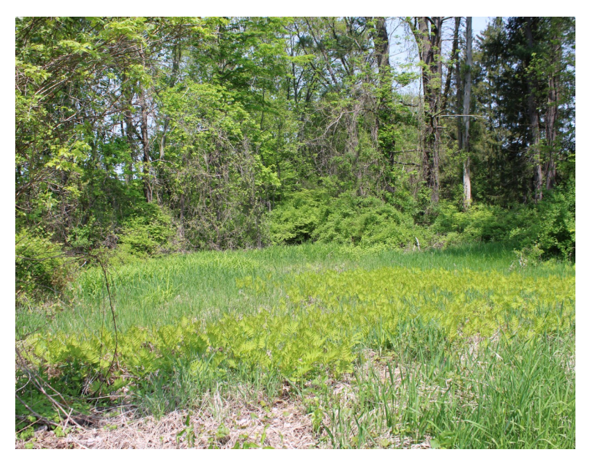
This Reed Canary Grass-Sensitive Fern meadow at the field station is a persistent native community of environments not wet enough for emergent marsh vegetation but too wet for many types of upland vegetation.

Native grasslands are highly restricted in their occurrence Connecticut. Early successional grasslands Bluestem Little meadows develop on dry sites that have lost their woody vegetation but they temporary replaced communities over time by woody plants unless they are regularly mowed.