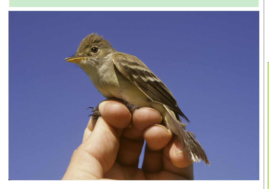
The Willow Flycatcher nests in shrub swamps and marsh edge shrubs.

D uring summer, the flycatcher family is well represented by a number of species in Connecticut. Some are associated with interior forest, although others are found at the forest edge, open environments and shrubby wetlands.