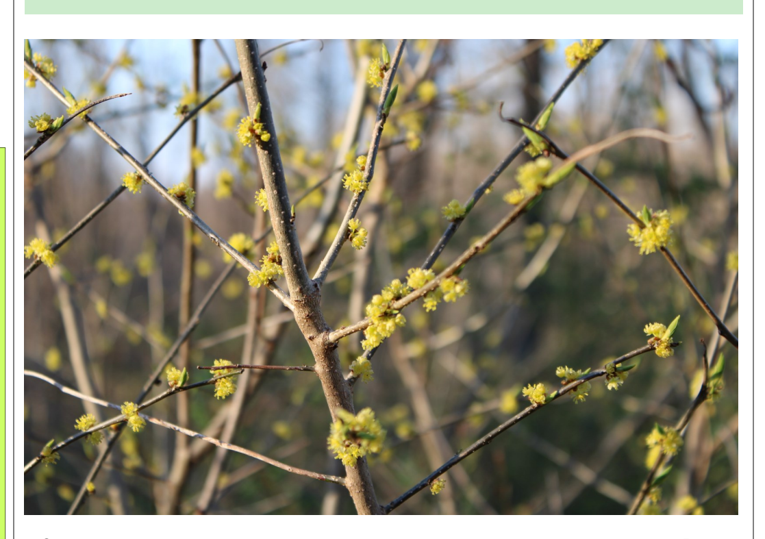
Spicebush is a native fleshy-fruited shrub or small tree that flowers in early spring. It is able to compete aggressively with alien invasive species.

"The Spicebush is one of these species and it has also proven to be an aggressive competitor with invasive alien species.